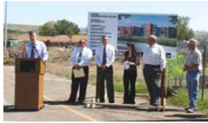
AUGUST Residence hall ground breaking