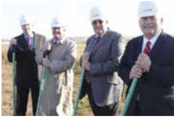
OCTOBER Ground breaking for Career & Technology Center