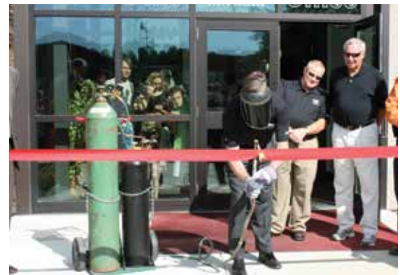
AUGUST Western Star Career and Technology Center grand opening