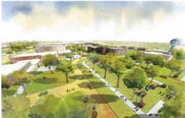
MARCH Master plan completed (paid for by City of Williston)