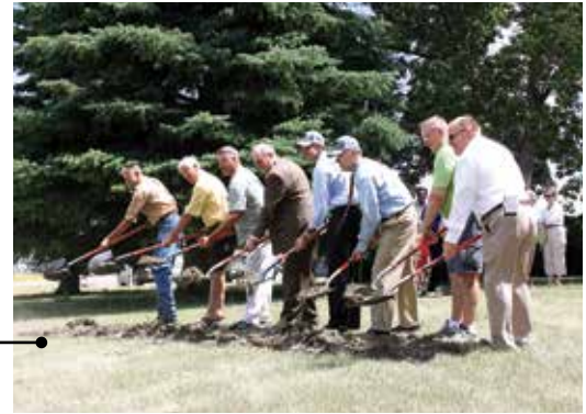
JULY Science Center ground breaking