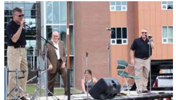
AUGUST Frontier Hall opening and dedication